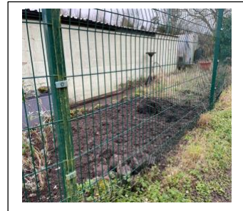
The overgrown area at the back of the shelter has gradually been cleared for planting.

We have put together a list of the things we would like to get done to improve the green, the gullies, the field shelter and the grounds for the new season. You can see the list and how and when you can get involved in the pages that follow.