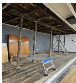
Exit stage right!