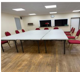
The main hall