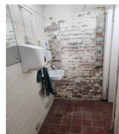
Ladies toilet W.I.P

As ever there have been unanticipated problems as the picture of the ceiling above the stage shows! The Bowls Club has contributed towards the costs of refurbishing the main toilets and we hope to have new water heaters, hand driers and soap dispensers fitted, and a makeover of the Ladies toilets done for this season. The leaking toilet in the Gents has been fixed, the urinals are now flushed at regular intervals, and we have hot & cold running water. More work in the Gents area will follow later.