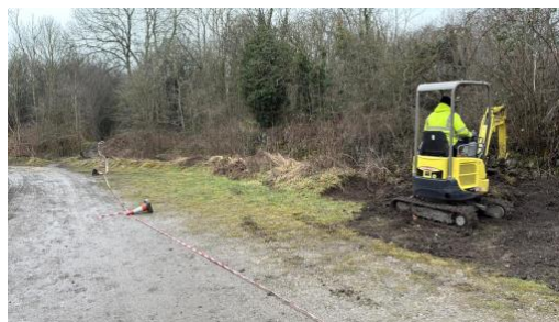
Work in progress in the car park

The inside of the building is also undergoing a major make-over. In the main hall: